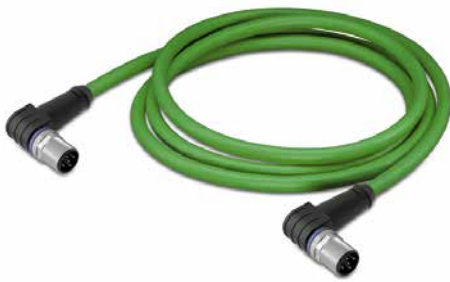
M12 D-coded Plug